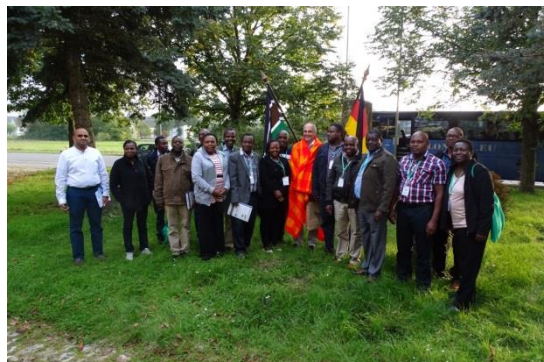
Kenyan delegation in Baunach

The “Technology Transfer Water (TTW)” project, that is located within the Bavarian Environment Agency (LfU), was established in 1999 by the Bavarian State Ministry of the Environment and Consumer Protection to support international cooperation in the field of water management. The structures in the environmental sector that were developed in Germany for decades, such as widely recognized standards, certified technical professional qualifications related to water management, as well as basic and advanced trainings are offered to interested partner countries.