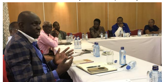
Discussion with experts from Kenyan water sector

The water supply in Kenya remains disrupted due to bottlenecks in the technical supply network and the country suffers from a correspondingly precarious sewage situation. Lately, the water administrations of municipalities have to cope with increasing water consumption by the raised number of consumers. All over Kenya, but especially in its northern provinces, the influx of refugees from war-stricken South Sudan and Somalia leads to increasing tensions between local populations and newcomers over water resources. Additionally, a severe draught further complicates water supply since the water levels lower from year to year.