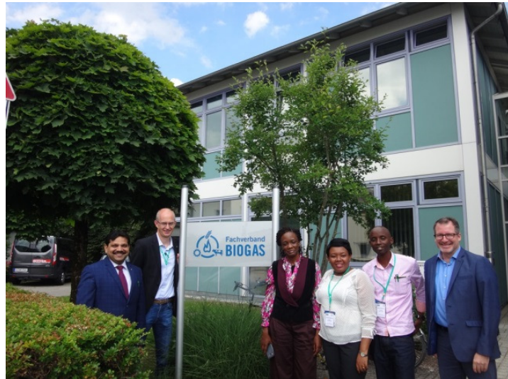
Visit to the German Biogas Association near Munich

The Inter Solar post-show report can be found here: https://www.intersolar.de/fileadmin/Intersolar-Europe/2_Exhibition_Participation/Post_Show_Report.pdf